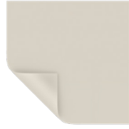
Ultra Wide Angle