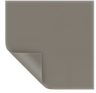
High Contrast Da-Tex